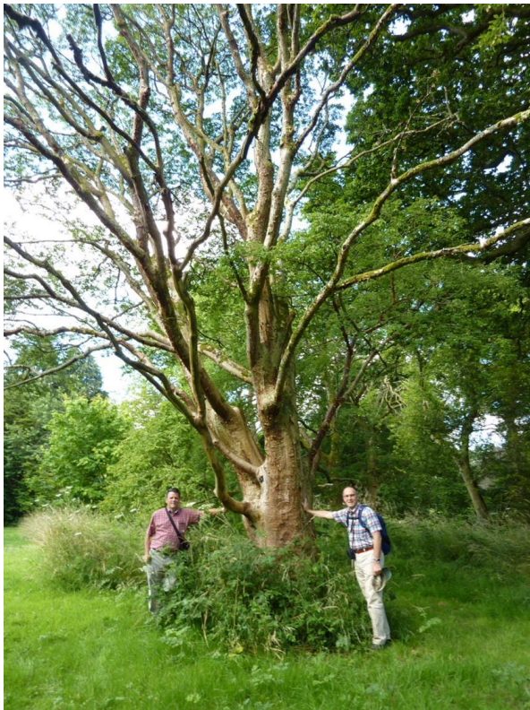
Figure 2. Example of an old specimen Aiello and Bachtell visited of A. griseum in the U.K.

In July 2014 Aiello and Bachtell visited venerable A. griseum specimens throughout the U.K. (Fig. 2) with a goal of visiting as many trees known or purported to have been collected by E.H. Wilson in 1901.