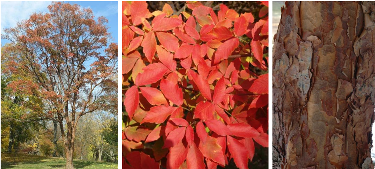
Figure 1. Acer griseum form, fall color, and bark.

maple, Acer griseum , is listed as endangered in its native habitat in central China (Fig. 1).